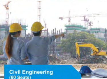
Civil Engineering (60 Seats)