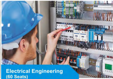
Electrical Engineering (60 Seats)