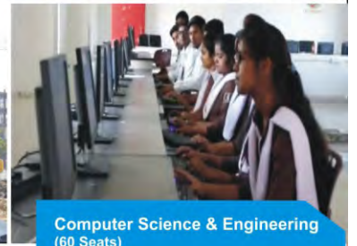
Computer Science & Engineering (60 Seats)