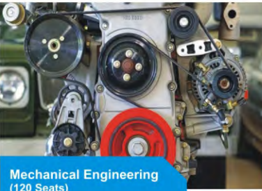
Mechanical Engineering (120 Seats)